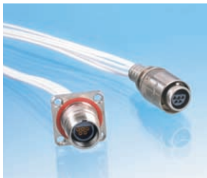
▲ 5 WAY METRIC THREAD CONNECTOR