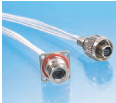
▲ 5 WAY ANTIDECOUPLING CONNECTOR