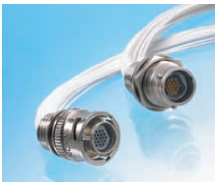
▲ 19 WAY BAYONET CONNECTOR