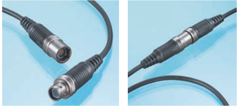
▲ 19 WAY BREAKAWAY ALUMINIUM CONNECTORS WITH OVERMOULDING