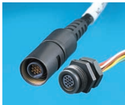
▲ CUSTOM DESIGN : 12 WAY THREAD COUPLING BRASS CONNECTORS, WITH MATT BLACK FINISH