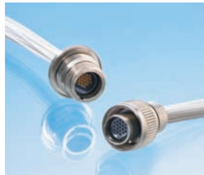
▲ 19 WAY ANTIDECOUPLING CONNECTOR