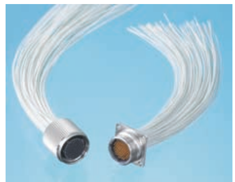
▲ 85 WAY THREAD COUPLING STAINLESS STEEL CONNECTORS